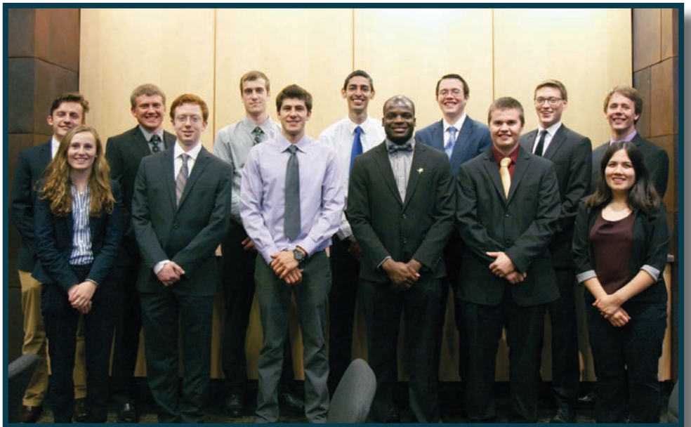
Summer 2015 interns

The bottom line is, no matter where a company is located or where their intern has studied, MnTAP intern projects result in impactful solutions that save businesses money and reduce waste, water, and energy use.