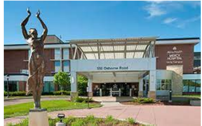
Unity Hospital & the North Suburban Hospital District | Mercy Hospital (allinahealth.org)