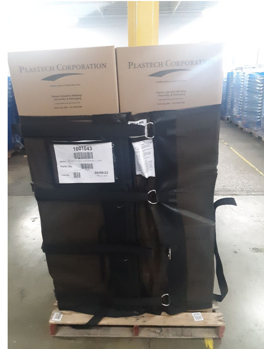
Figure 1: Reusable Pallet Wrap