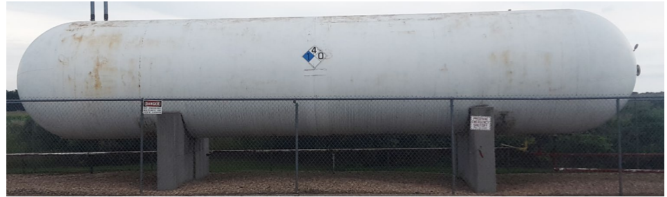
Figure 2: Propane Tank