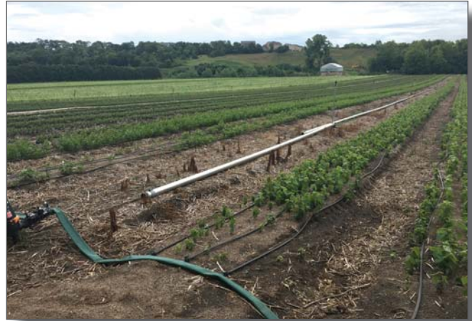
Irrigating at the Nord Farm

At the Nord Farm, the project was to map the rain flow and drainage system on the property. MnTAP intern Christine Peltó, proposed a pond pumping and treatment system to reuse and recycle irrigation and rain water. This would reduce the amount of water pumped daily from the groundwater table, and reduce runoff and sediment. There is potential for Bailey's to save 38 million gallons of water per year at Nord Farm. ■